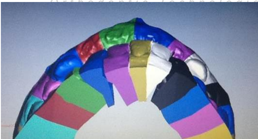
Orchestate3D – Diagnostic Setup